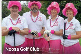
Noosa Golf Club