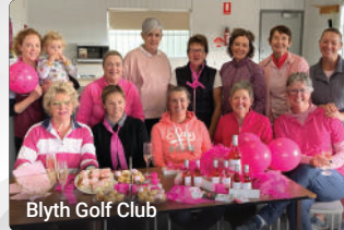
Blyth Golf Club