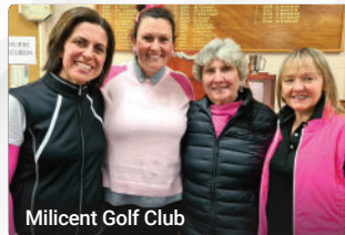
Millicent Golf Club