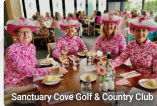
Sanctuary Cove Golf &amp; Country Club