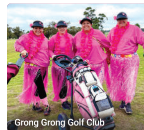
Grong Grong Golf Club