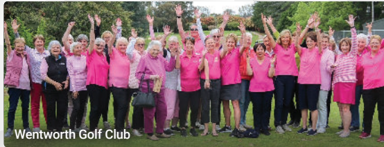
Wentworth Golf Club