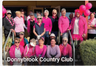
Donnybrook Country Club