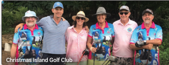
Christmas Island Golf Club