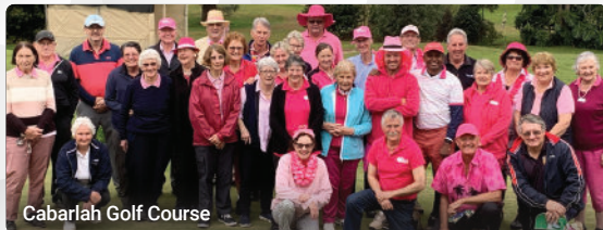
Cabarlah Golf Course