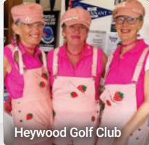
Heywood Golf Club