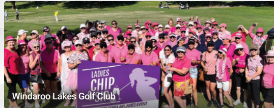
Windaroo Lakes Golf Club