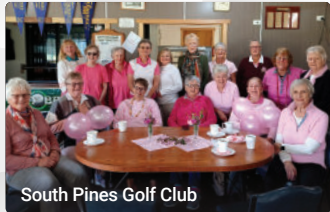
South Pines Golf Club