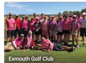
Exmouth Golf Club