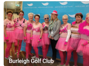
Burleigh Golf Club