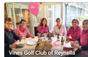
Vines Golf Club of Reynella