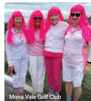
Mona Vale Golf Club