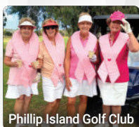
Phillip Island Golf Club