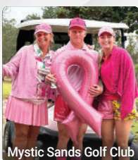
Mystic Sands Golf Club