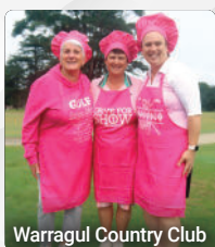
Warragul Country Club