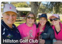
Hillston Golf Club