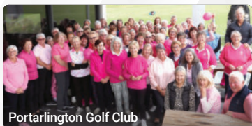
Portarlington Golf Club