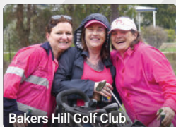
Bakers Hill Golf Club