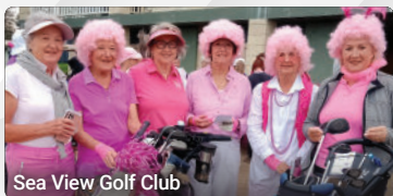
Sea View Golf Club