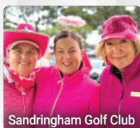
Sandringham Golf Club