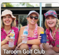
Taroom Golf Club