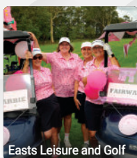
Easts Leisure and Golf